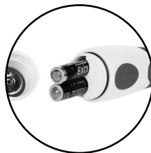
2 AAA batteries