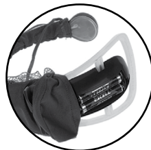
2 AAA batteries