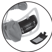
2 AAA batteries