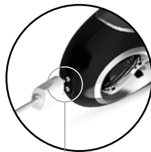
Magnetic charging port