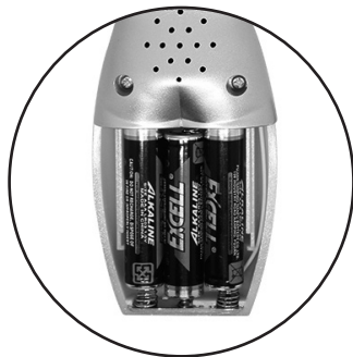
3 AAA batteries