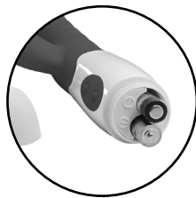
2 AAA batteries