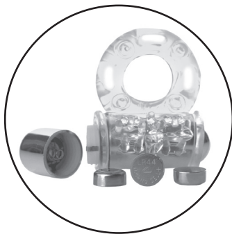
3 LR44 batteries