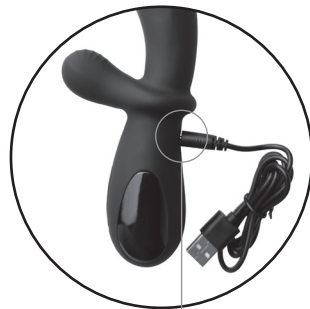
USB charging port