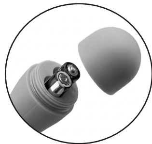
2 AAA batteries