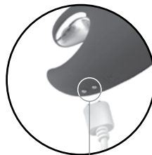
Magnetic charging port