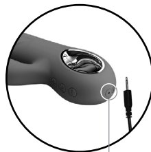
USB charging port