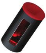
F1S™ V2 Red