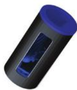
F1S™ V2 Blue