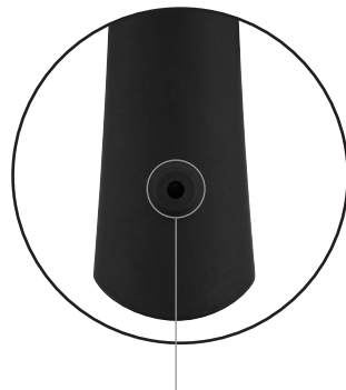
USB charging port