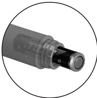
1 AAA battery