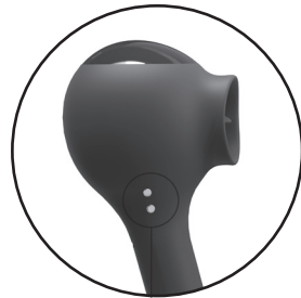
Magnetic USB charging port