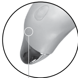
USB charging port