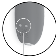
Magnetic charging port