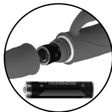
1 AAA battery