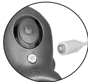
Magnetic charging port