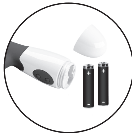
2 AAA batteries