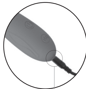
USB charging port