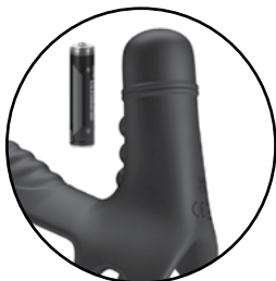
1 AAA battery