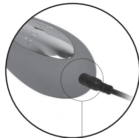
USB charging port