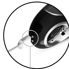
Magnetic charging port