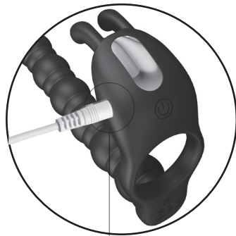
USB charging port