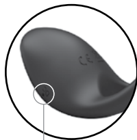
USB charging port