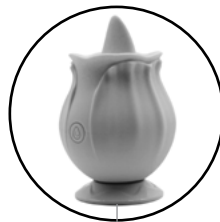
Magnetic charging base