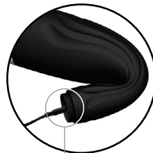
USB charging port