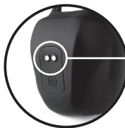
Magnetic charging port