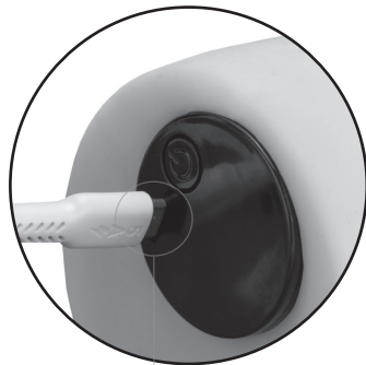
Type-C charging port