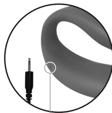
USB charging port