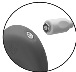
Magnetic charging port