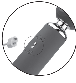
Magnetic charging port