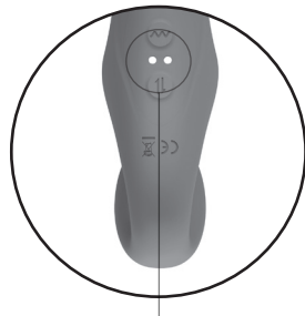
Magnetic USB charging port