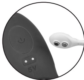
Magnetic charging port