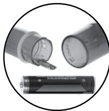
1 AA battery