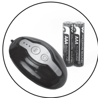
2 AAA batteries